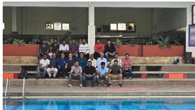
The Executive Committee with Captains

The Executive Committee met on 17 th March 2024 at 11 AM in Malleshwaram Club and finalized the upcoming KBGA Cricket and Football matches. The registered teams are geared up for the competition and the process for fixing the playground has been authorized by the EC