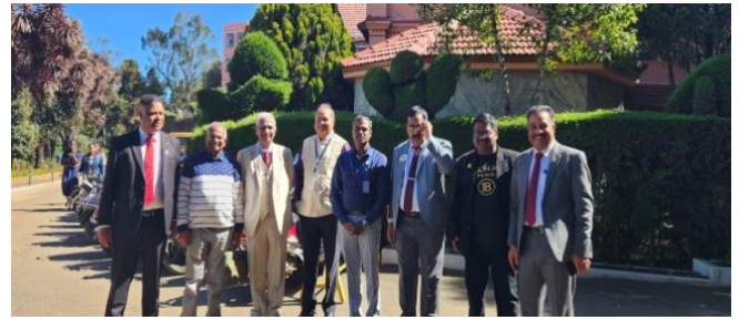
THE ORGANIZING TEAM IN JSS COLLEGE OF PHARMACY