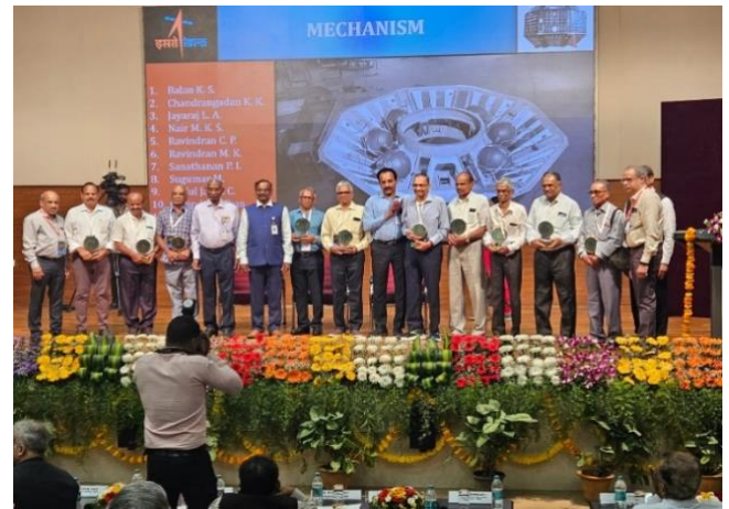
MECHANICAL WORKSHOP GROUP WITH CHAIRMAN