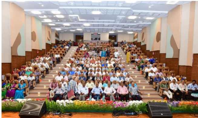
THE ARYABHATANS ASSEMBLED ON 10 TH MARCH 2025

heartening to see younger scientists from LEOS facilitating the event. Their enthusiasm and care, as they assisted us with transportation and interacted with those of us whose average age is around 75, was truly touching.