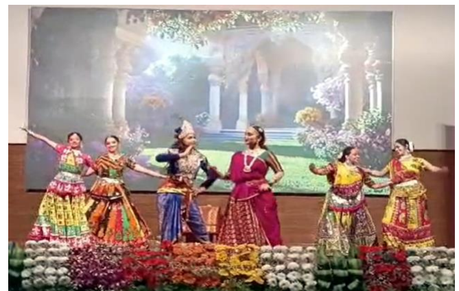
WONDERFUL DANCE PROGRAM