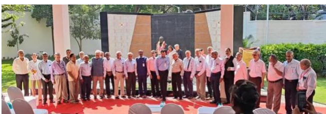
Dignitaries in the Bust unveiling ceremony