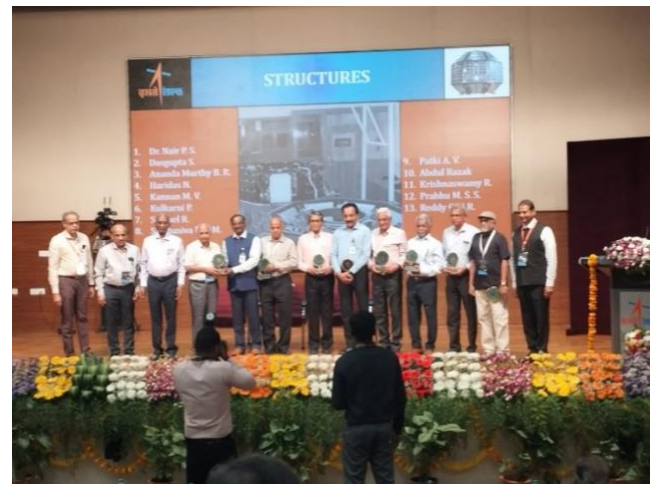
Aryabhata Structural Engineers