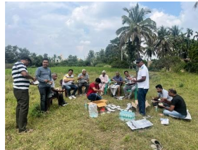
THE TEAM OF 12 PEOPLE STAYED FROM 10 AM TO 3 30 PM IN THE HOT SUN BUT IT WAS PICNIC ATMOSPHERE