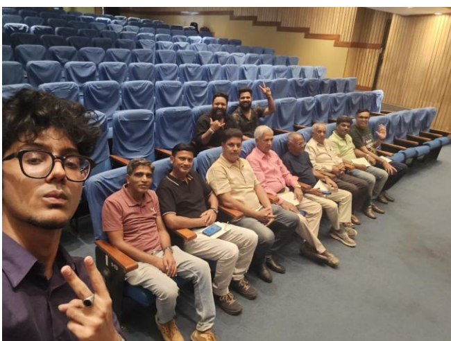
THE CONVENTION HALL WITH 500 SEATS