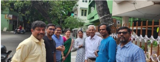
The Basava Academy team with Chairman AAA