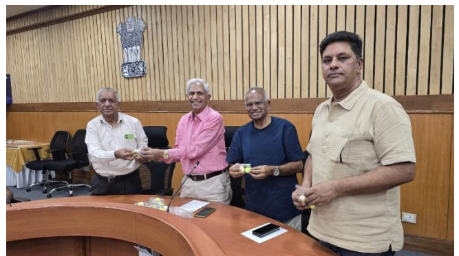
Self-healing Acupressure kit was presented to the participants.

The IBM team visited the venue, discussed with the authorities and cleared the venue for booking on 6 th June 2025. Again visited on 27 th June for final meeting for reviewing the arrangements by different committees.